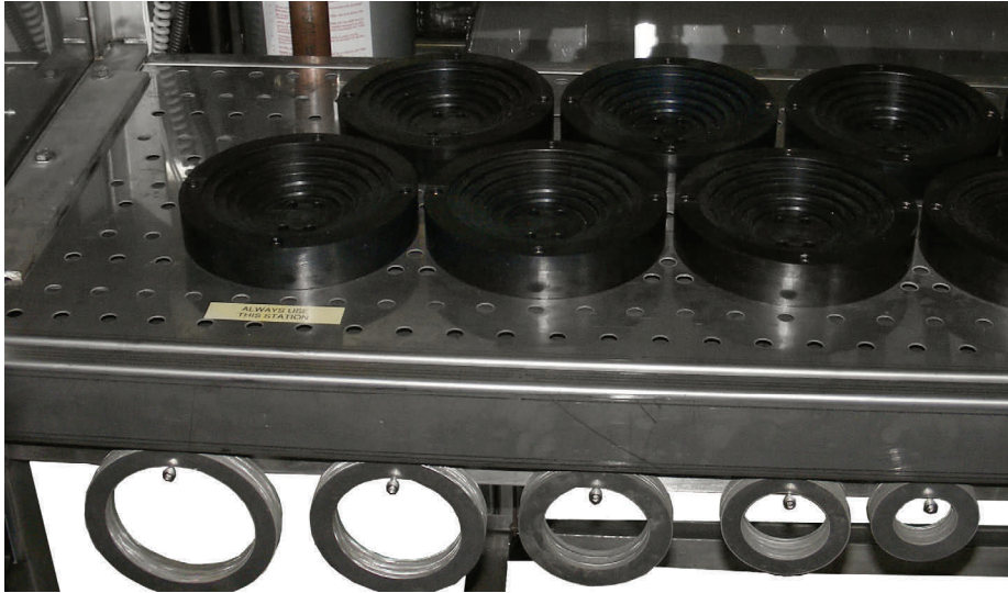
Hot Fill Machine details